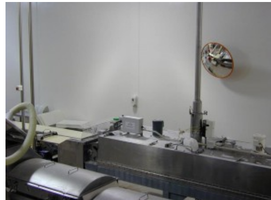
450mm Acrylic Food Processing Mirror