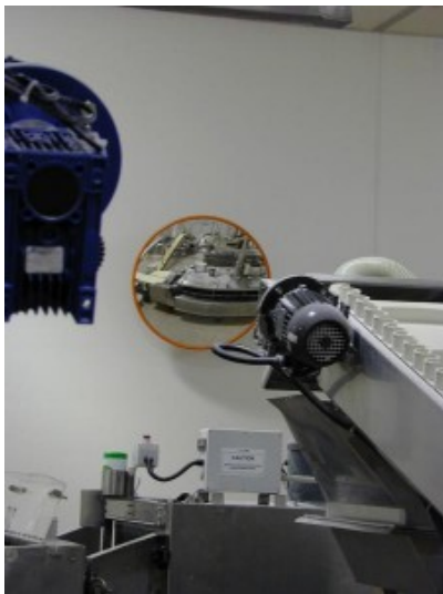
450mm Acrylic Food Processing Mirror