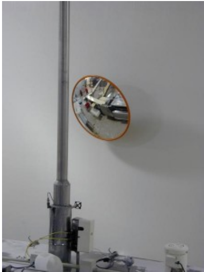
450mm Acrylic Food Processing Mirror