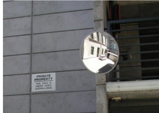
600mm Heavy Duty Exterior Mirror