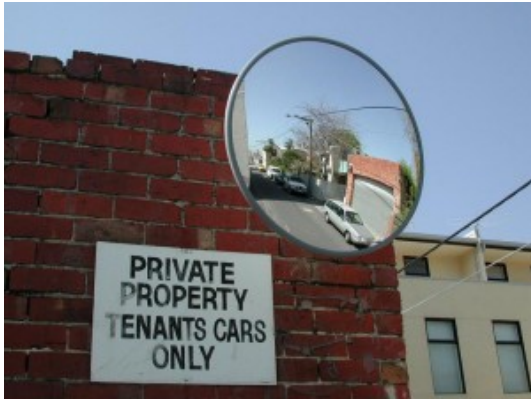
600mm Heavy Duty Exterior Mirror