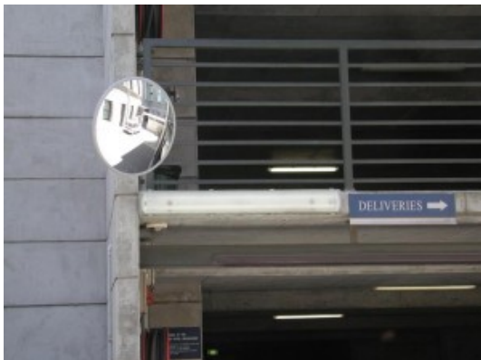
600mm Heavy Duty Exterior Mirror