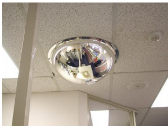
600mm Acrylic Ceiling Dome