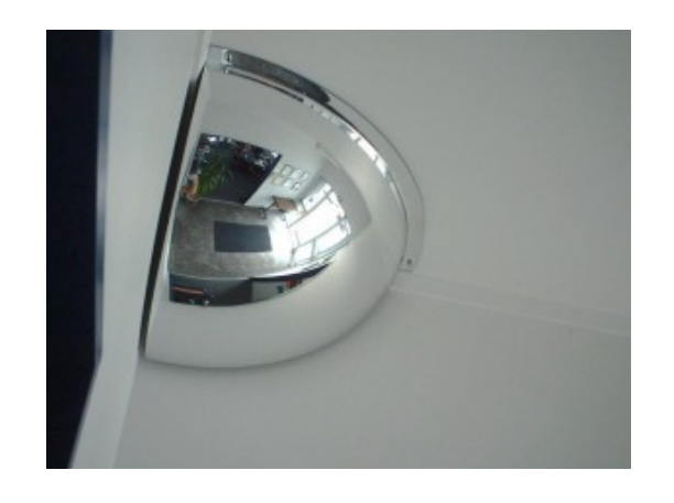
300 x 300mm Quarter Face Mirror