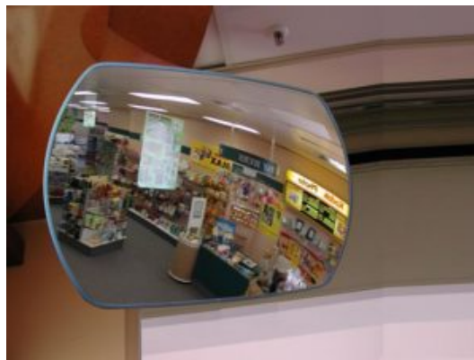
600x400mm Acrylic Interior Mirror