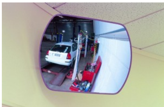
600x400mm Acrylic Interior Mirror