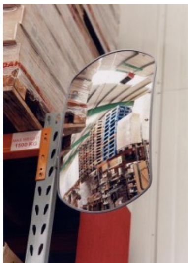
600x400mm Acrylic Interior Mirror