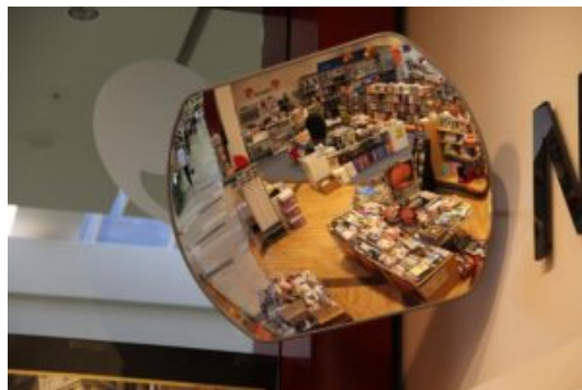
600x400mm Acrylic Interior Mirror