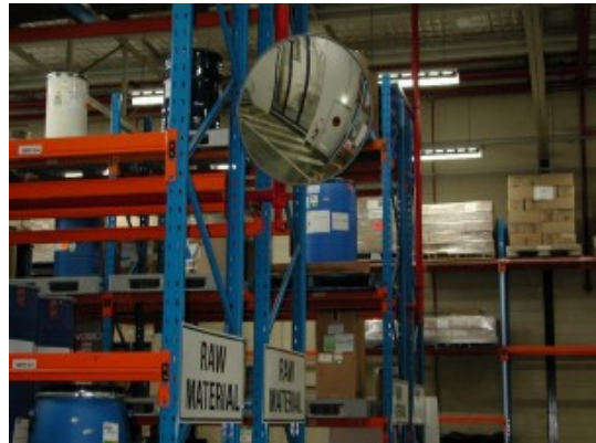
900mm Acrylic Interior Mirror