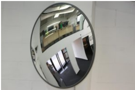
900mm Acrylic Interior Mirror