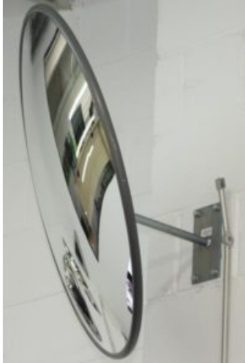
900mm Acrylic Interior Mirror