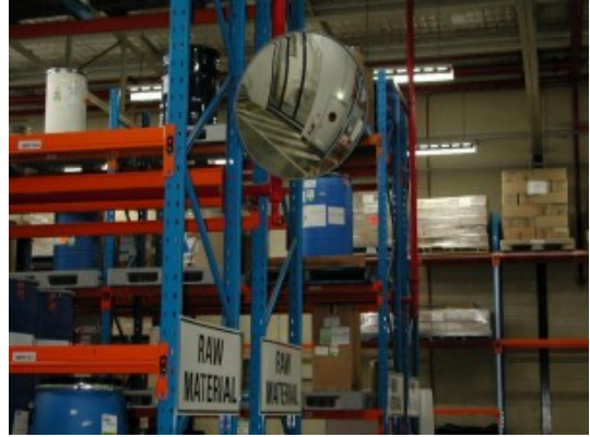
900mm Acrylic Interior Mirror