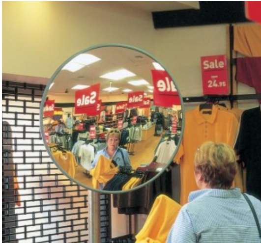
900mm Acrylic Interior Mirror