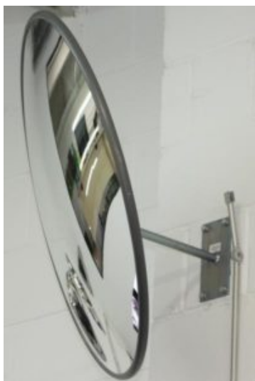
900mm Acrylic Interior Mirror