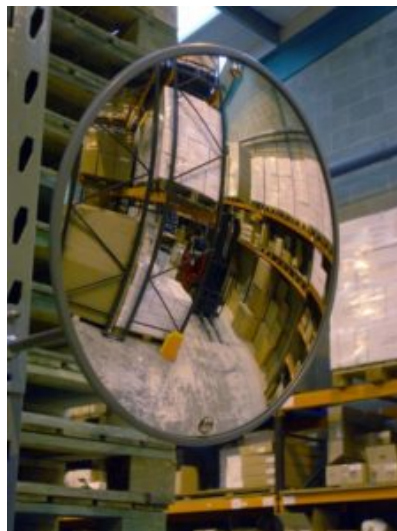
300mm Acrylic Budget Indoor Mirror