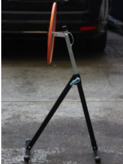
MOT Inspection Mirror Set