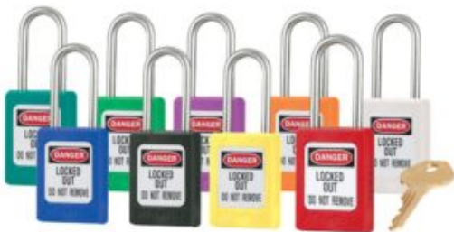
S31 Safety Padlock Colour Variations