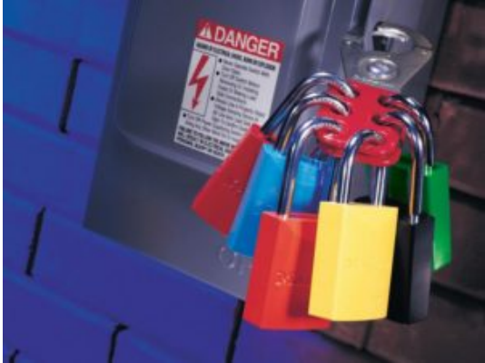
Scissor Type Safety Lockout Hasp