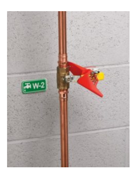
Wedge Style Quarter Turn Ball Valve Lockout