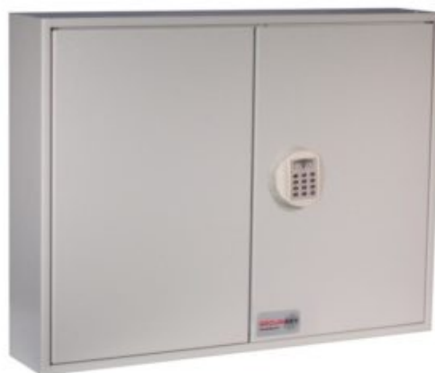
Key Vault Padlock 100 Electronic Lock REVO A