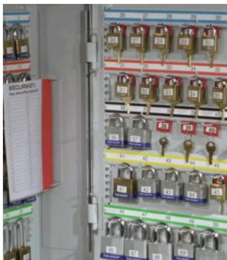
Key Vault Padlock Interior