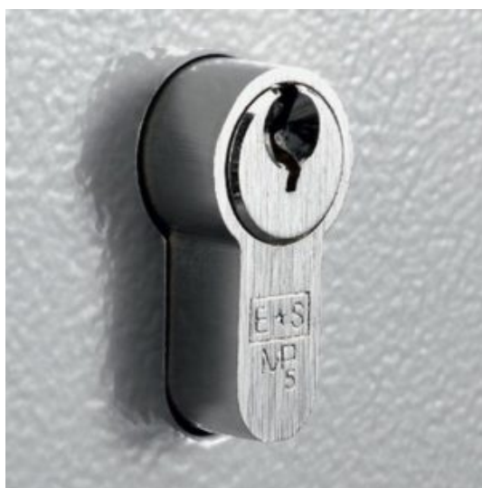
Euro Profile Cylinder