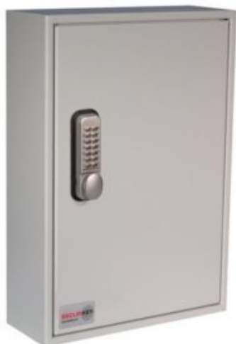
Key Vault Padlock 50 Push Button Combination Lock