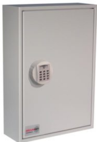
Key Vault Padlock 50 Electronic Lock REVO A