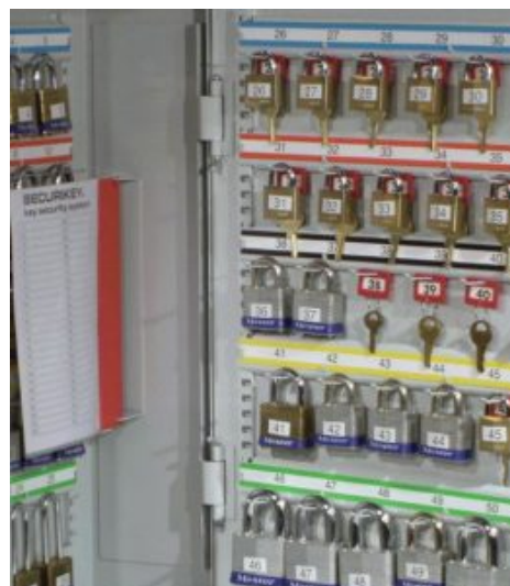
Key Vault Padlock Interior