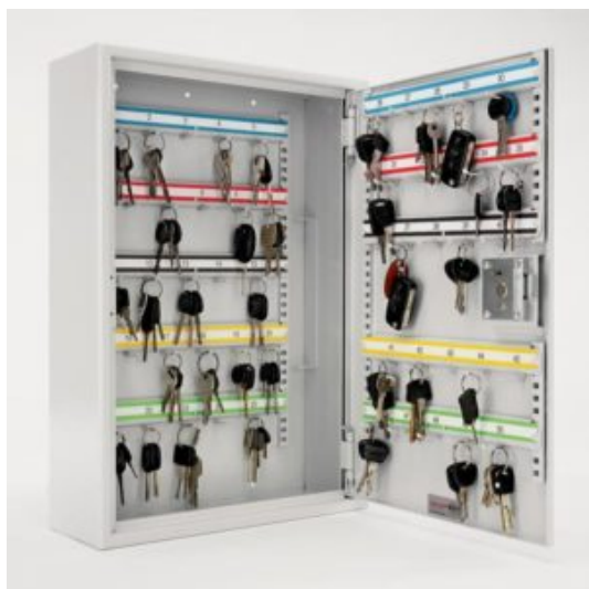
Key Vault Padlock 50