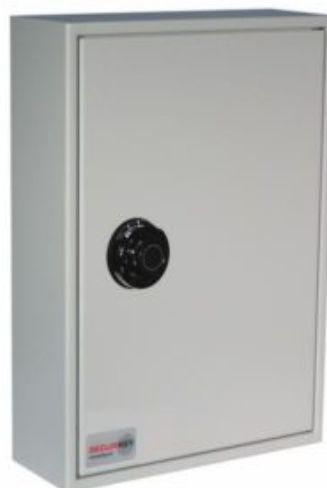
Key Vault Padlock 50 Dial Combination Lock