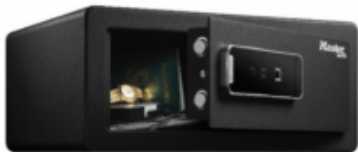
Biometric Safe LX110BEURHRO open