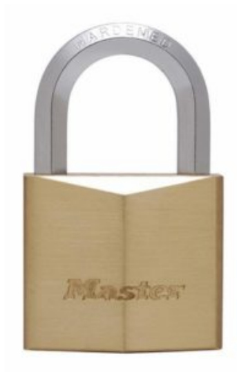
50mm High Security Brass Padlock