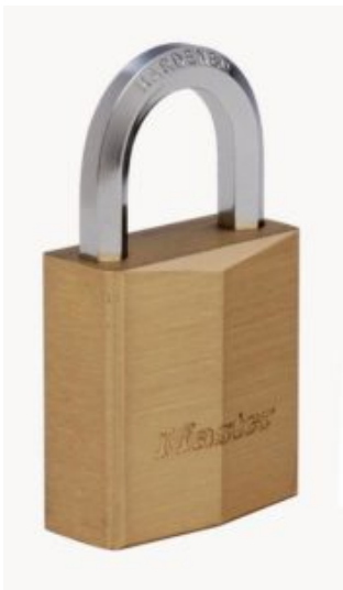
50mm High Security Brass Padlock