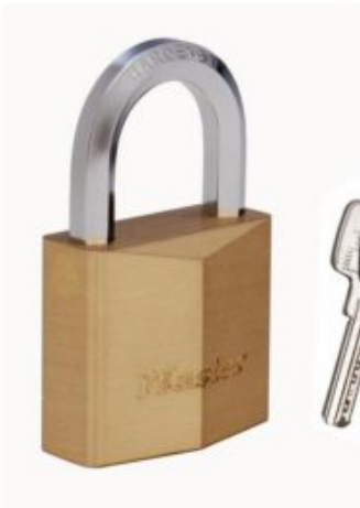
40mm High Security Brass Padlock