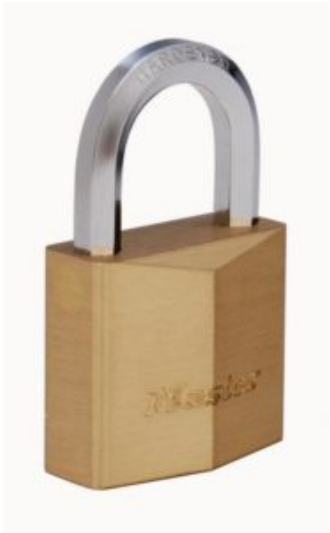
40mm High Security Brass Padlock