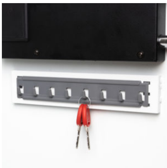
Ammunition cabinet 200D hookbar