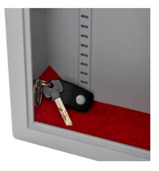
Electronic Key Safe 70 key