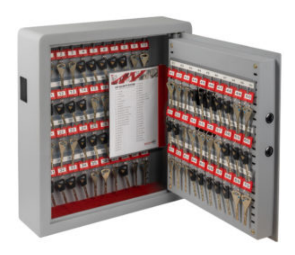
Electronic Key Safe 70 With Deposit OPEN