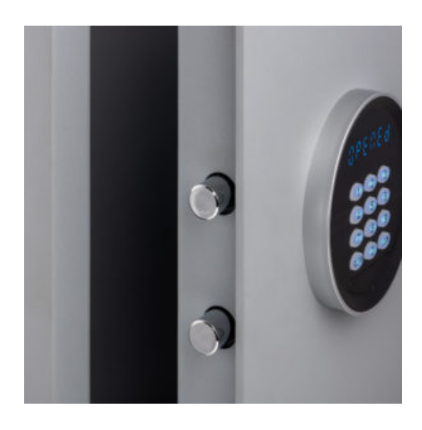
Electronic Key Safe 70 bolts