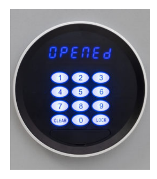
Electronic Key Safe 70 Keypad