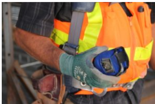
Toolmate Tape Measure Jacket