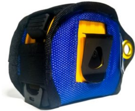
Toolmate Tape Measure Jacket