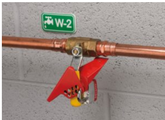
Wedge Style Quarter Turn Ball Valve Lockout