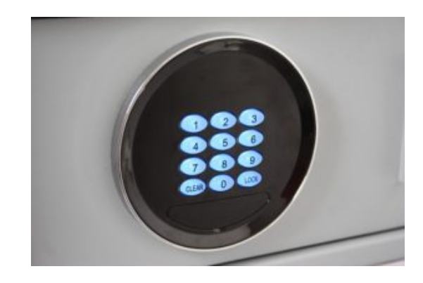
Euro Vault - Illuminated Keypad