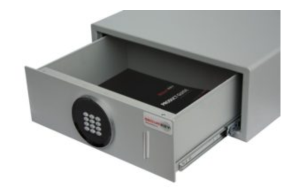
Euro Vault Drawer Safe 17L - Drawer Open