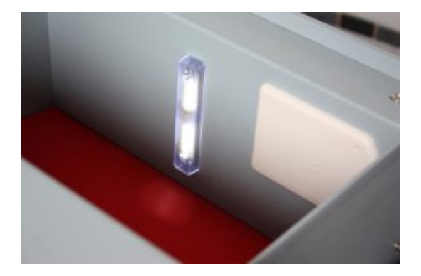
Euro Vault Drawer Safe - Internal Light

Euro Vault Drawer Safe 17L - Drawer Open