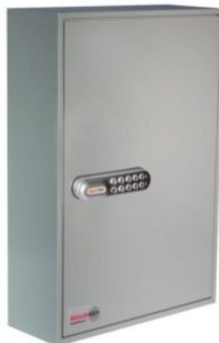
System 50 Padlock CL1000 Electronic Cam Lock