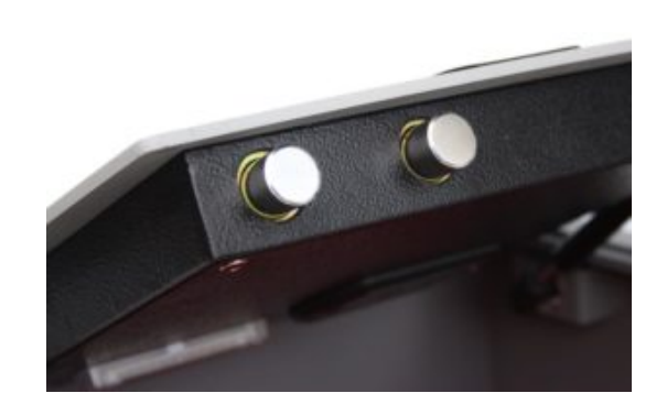
Euro Vault Gas Strut Safe