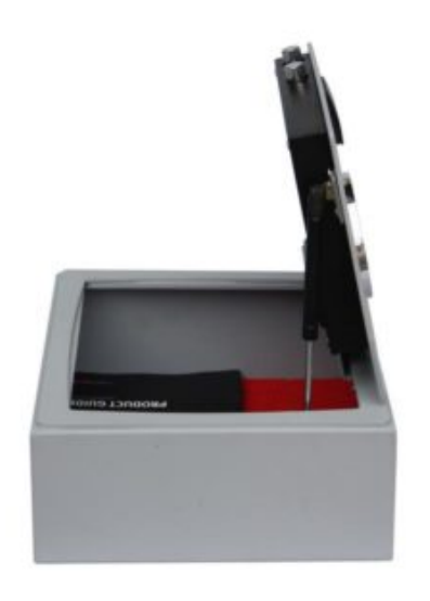
Euro Vault Gas Strut Safe