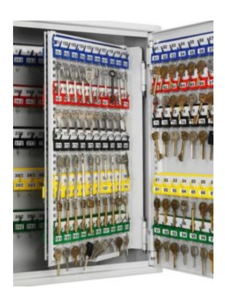
Key Vault Interior