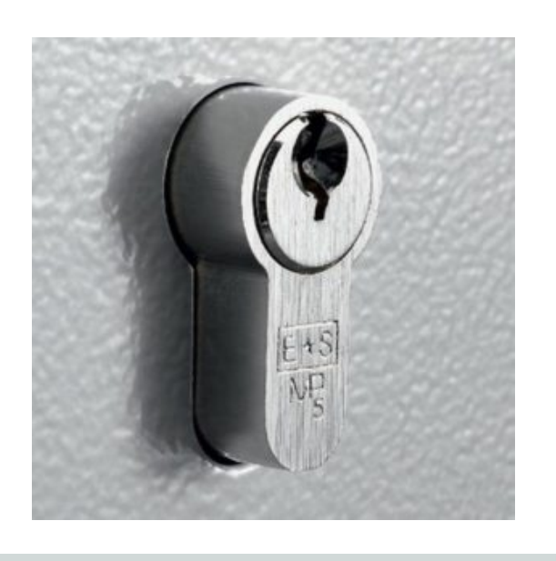
Euro Profile Cylinder