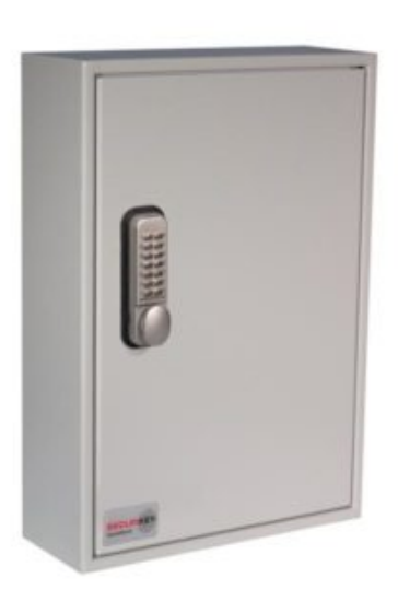
Key Vault 200 Push Button Combination Lock