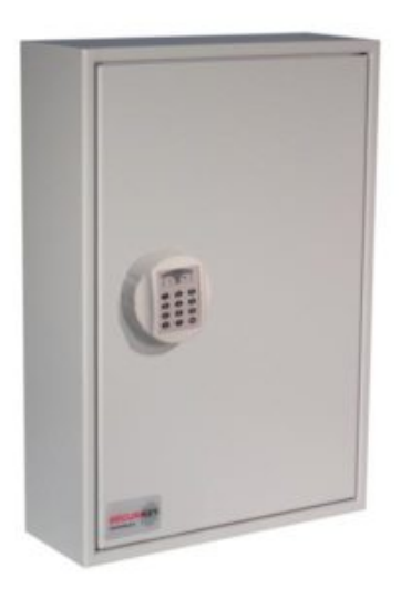
Key Vault 200 Electronic Lock REVO A