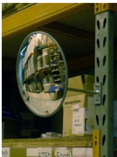
300mm Acrylic Budget Indoor Mirror