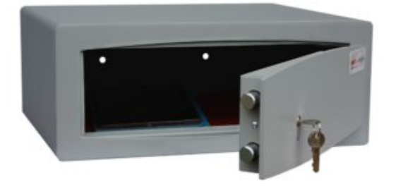
Euro Vault Key Locking