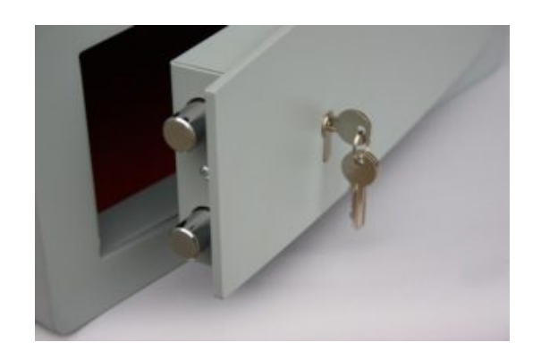
Euro Vault Key Locking